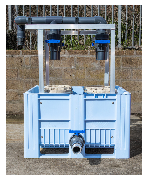
Above: Filtration System