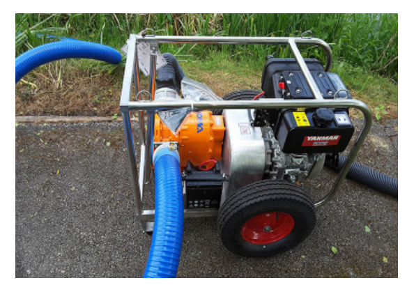
Above: Portable VikoPump