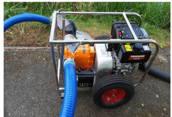
Above: Portable VikoPump