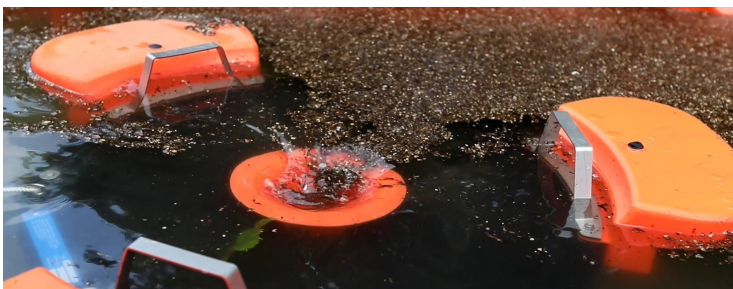
Below: Examples of the Skimmers working with plastic pellets