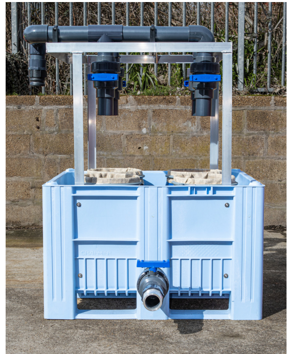
Above: Filtration System