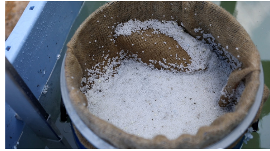
Above: Plastic pellets recovered and filtered

Spares Kit Extension hoses Additional filtration bags