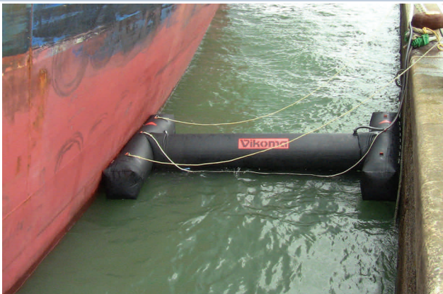
Vikoseal in situ between ship and quayside